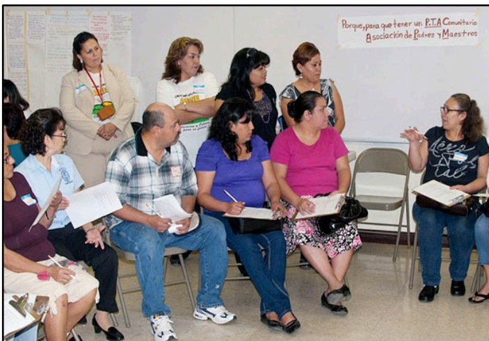
A resident from the community voices her thoughts on why a community PTA is needed in this area.

With the support of this PTA, mothers have begun to support their children in a way that wasn’t possible for them before. The state offers so many programs that we are either not aware of or simply don’t understand very well. We want to know and understand all the changes in state and federal laws in regards to education. That is a necessity for us. It is also important for us to support other communities so that they too have these tools in their hands.”